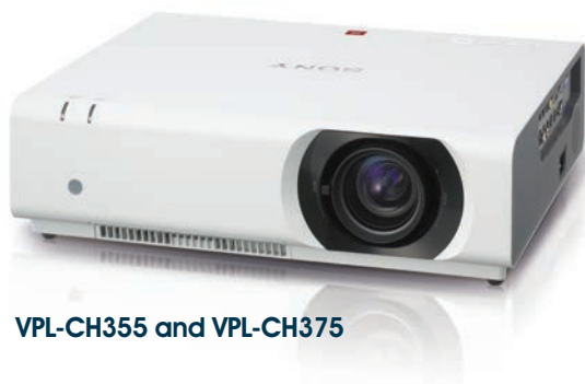
VPL-CH355 and VPL-CH375

When it comes to equipping medium to large-sized classrooms or meeting rooms, cost is critical. The VPL-CH355 and VPL-CH375 are a cost-effective choice with no compromise on picture quality.